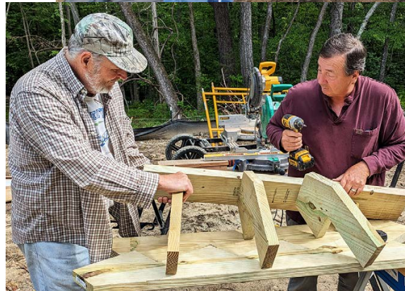
Groundbreaking followed by lots of volunteer effort led to the big celebration below.