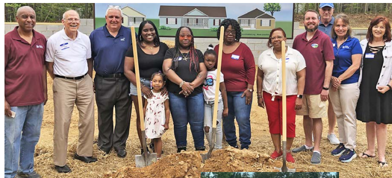
From top, l to r: Nelson Health Fair Cumberland Juneteenth Bingo fun Red Hill event Crewe ground- breaking BHS-built shed

fundraiser. In Prince Edward, the group stayed busy at the National Night Out, Heart of Virginia Festival, and with multiple bingo fundraisers.