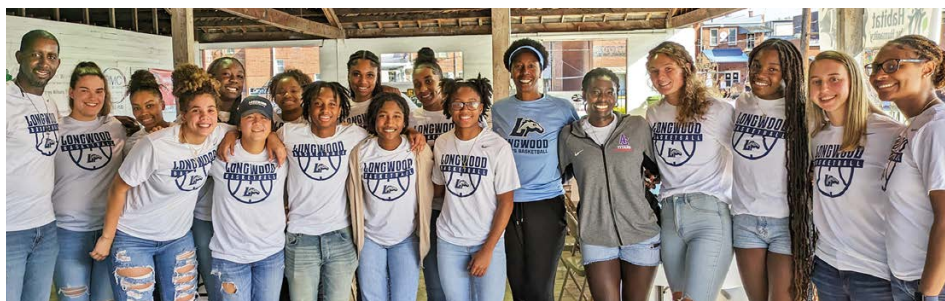
LU Women's Basketball Team